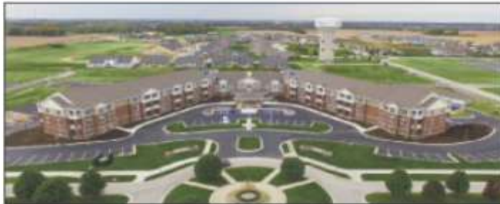
Park Place of St. John opened its retirement living building in December, and the community continues to grow: of the 60 apartments in the building, 45 will be occupied by the end of the month.

"I have found a comfortable spot at Park Place, and I feel like this is home," she said.